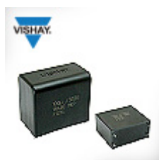
Vishay MKP1848C DC-Link film capacitor