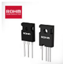
Rohm 4th Generation SiC MOSFET