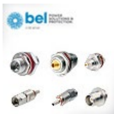
Belfuse Johnson Waterproof RF connectors