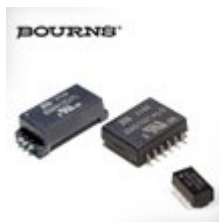
Bourns BMS transformer