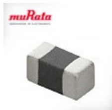
Murata SMD Type NTC NCU18 & NCU15 series