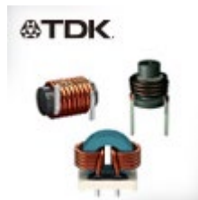
TDK Power Line Chokes