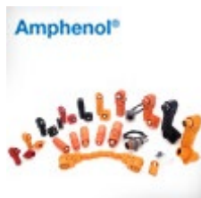
Amphenol Surlok Plus® connector

Avnet together with the leading suppliers bring you the best Sustainable technology - Green energy products.