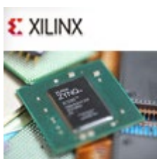
Xilinx New energy intelligent gateway