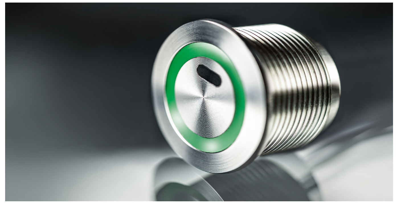
SCHURTER TTS: high-precision, touchless Metal Line switch in optical ToF technology (Time of Flight)

Please, do not touch! Because that doesn't have to be the case at all. A new generation of switches for touchless switching has been developed for exactly this purpose. Switching without touching. Switching without contaminating the surface with potentially harmful germs, viruses or bacteria. How do these switches work and what are they capable of?